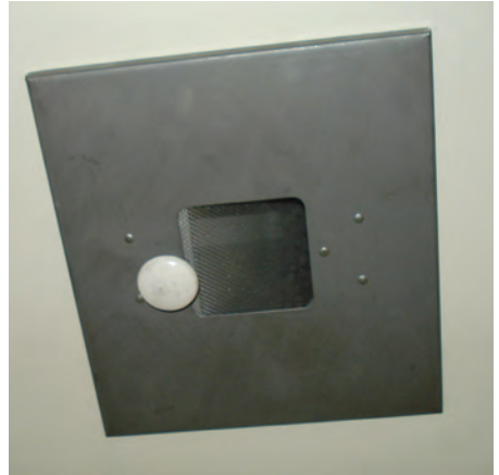
Laundry Room Lint Trap. Typically located above washer/dryer. Refer to Homeowners manual for suggested maintenance guidelines.