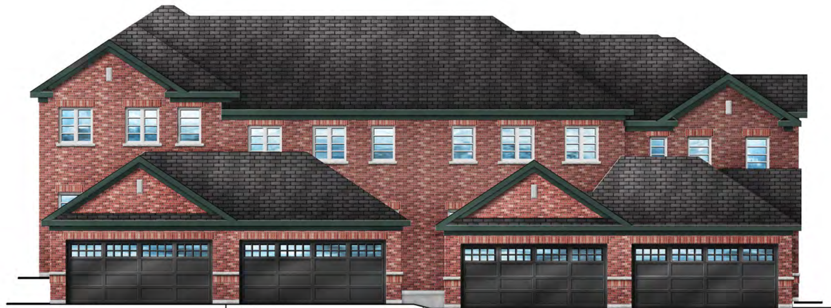
GALE 1A ELEV -3 TH-4 GALE 1A ELEV -2 TH-3 GALE 3A ELEV -1 TH-2 GALE 3A ELEV -2 TH-1 REAR ELEVATION

Plan is not to scale. Sole purpose of plan is to show approximate location of a lot/block within a subdivision. The numbering, size, dimension, area, shape and location of the lots/blocks may vary from what is shown on the plan. All dimensions are approximate. The Vendor tries to ensure the accuracy of the information at the time the plan is prepared, however modifications to the plan may have occurred since its preparation and errors do occur. E. & O. E.