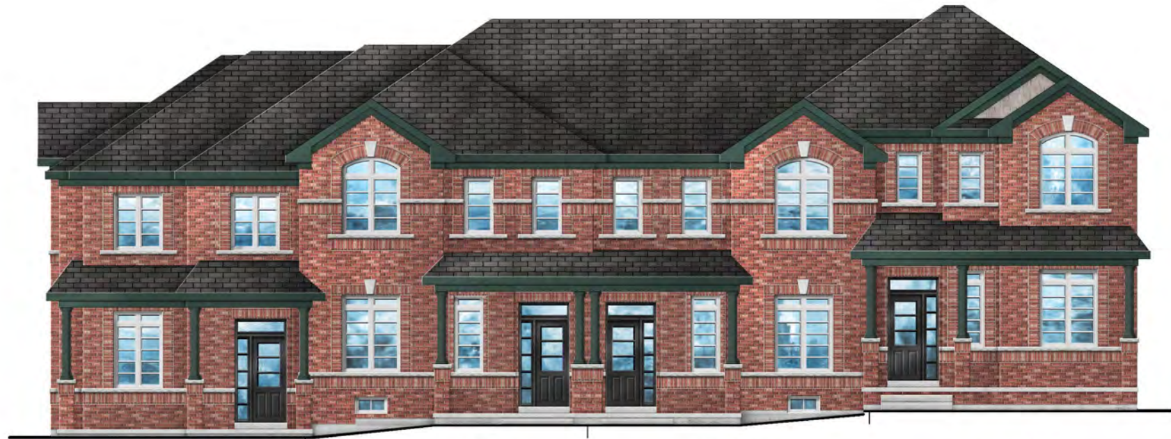
HOLLAND 14 ELEV-1 TH-1 HOLLAND 3A ELEV-1A TH-2 HOLLAND 3A ELEV-1(REV.) TH-3 HOLLAND 8E ELEV-1(REV.) TH-4 FRONT ELEVATION