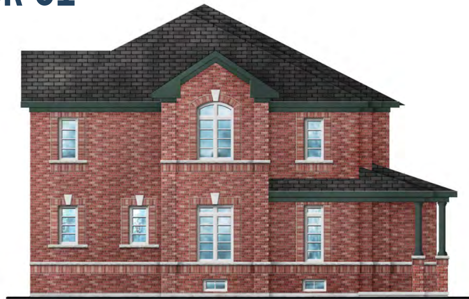
HOLLAND 14 ELEV-1 TH-1 FLANKAGE ELEVATION