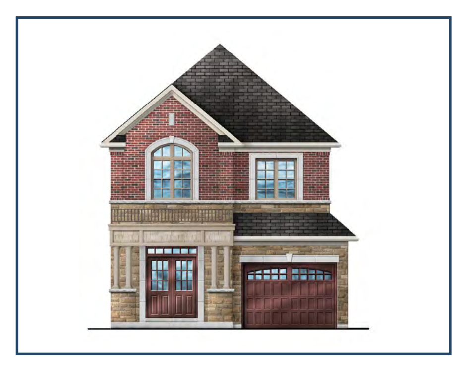
ELEVATION 3 ELEVATION 1